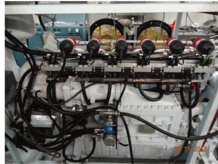
Fig. 2. Ignition system and post-process gas fuel supply system of 6-cylinder engine

equipped. The fuel supply and ignition system of the 6-cylinder engine are shown in Figure 2 and the 12-cylinder engine in Figure 3.