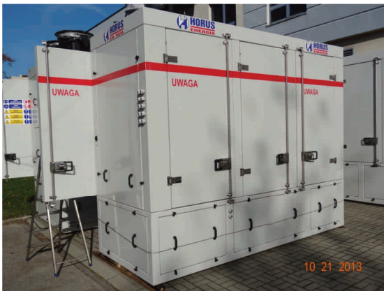
Fig. 1. View of the power-generator set while equipping with elements of the electronically controlled fuel supply system of post-processing gas, in front of the building of Engines Laboratory of Cracow University of Technology

The choice of this unit was resulted mainly due to the fact that MAN offered a 12-cylinder engine with the same geometric cylinder dimensions. Because the research program's assumptions envisaged the development of a single-cylinder power conversion concept, the modular design of the 6-cylinder and 12-cylinder engine fulfilled the stated condition. All elements of the developed concept of electronically controlled post-processing gas injection system as well as the control system itself were made at the Cracow University of Technology. Equipping of the power generators supplied by HORUS-Energia with all the elaborated and made elements of the system was made also here. After these operations, the aggregates were transported to a specially constructed facility, located in one of the "AZOTY S.A." plants. Fig. 1 shows the aggregates in enclosures during equipping with elements of the system in front of the Engines Laboratory of Cracow University of Technology.