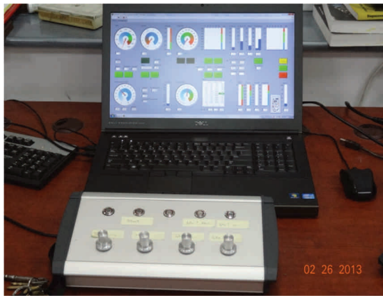
Fig. 4. General view of the control panel of the programmable controller