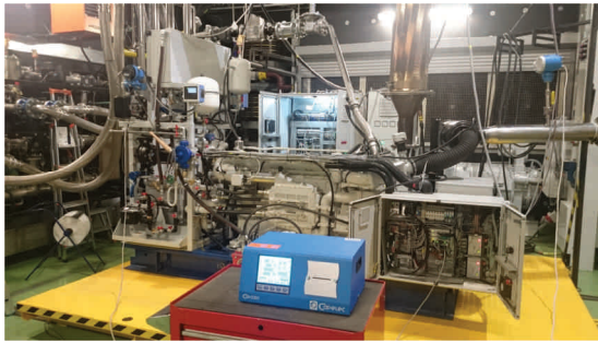
Fig. 6. View of a part of a laboratory test stand with a electric current generator – Horus Energia

In the choice of fuel for combustion engines, the problem is often too low calorific value of fuel because in such cases a high share of engine power losses relative to its effective power results in a reduction of the total efficiency of the power generator unit. Therefore the concept of the system provides for the possibility of co-fuelling and co-firing of fuels with very different calorific values or very different knock resistance. In this range a study of the developed concept has been carried out to investigate the acceptable calorific values of the supplied gas at which the generator engine is able to operate properly.