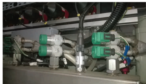
Fig. 3. Post-process gas fuel supply system of 12-cylinder engine

Original spark plugs, recommended by MAN during natural gas supply, were replaced by spark plugs where the spark channel of spark plug was more put out into the combustion chamber. This change has been made on the basis of experimental research and has resulted in a significant improvement of ignition initiation of fuel mixtures. This change was especially important when the engine was powered with a very lean air-gas mixture.