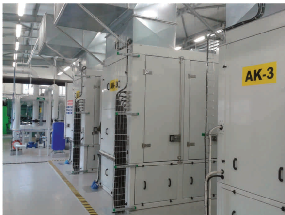
Fig. 6. Power generators with electronically controlled, post-processing gas injection system, located in one of the "AZOTY S.A." plants

Based on the developed concept of engines injection feeding with post processing gases, at Cracow University of Technology was done the project, components of the system were made and three engines have been equipped with them: one 6-cylinder with a nominal power of 200 kW and two 12-cylinder engines with a nominal power of 400 kW. The total rated power of three motors prepared for exploitation tests was 1 MW, assuming the supply of natural gas, while the power output at the other chemical compositions feeding was respectively lower. The engines, after being equipped with the developed post-processing fuel supply system, were connected to the generators and placed in the HORUS-Energia unit. In such form, the units, marked with the symbols AK-1, AK-2 and AK-3, were put into operation in February 2014 in a facility, located in one of the "AZOTY S.A." plants. Up to now, engines run continuously, depending on the supply of gaseous post-processing fuel, as source of generating electricity and heat. During the operation a number of studies were conducted, the results of which confirmed the preliminary assumptions of the developed concept. Figure 5 shows the aggregates working in a specially built facility, located in one of the "AZOTY S.A." plants.