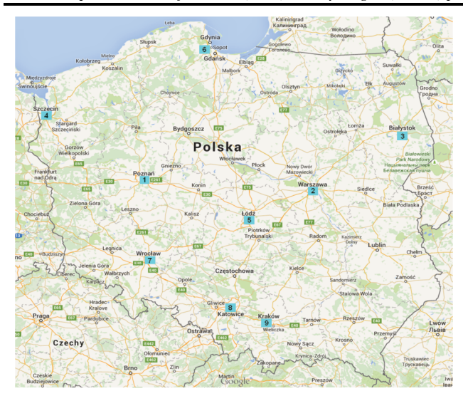
Fig. 4. Map of Poland with marked sites of the proposed public hydrogen refuelling station locations [17]