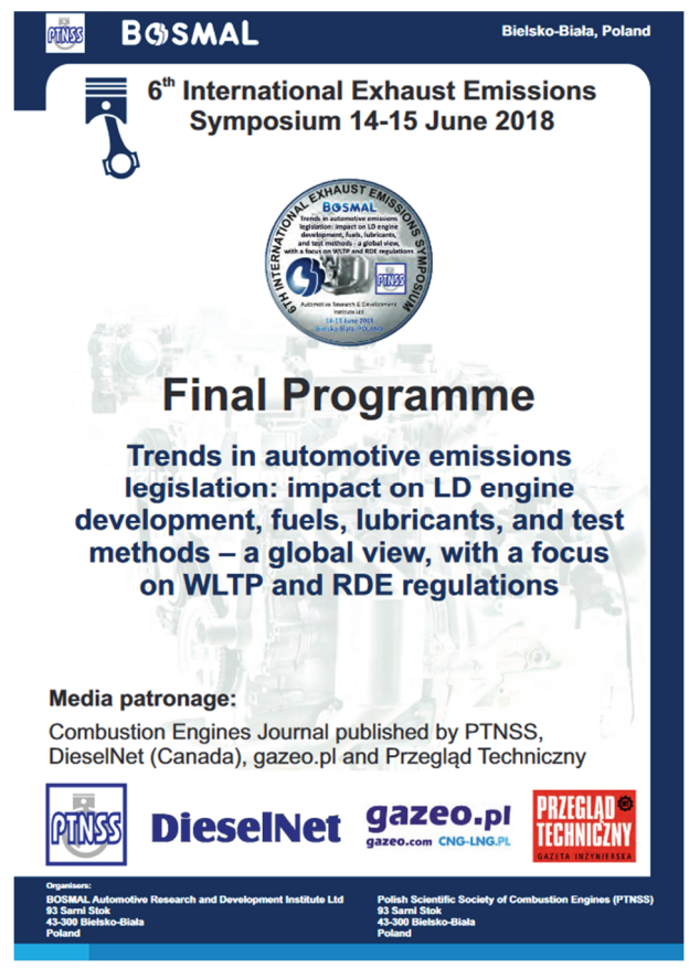
Fig. 2. First page of the Final Programme of the 6th Exhaust Emissions Symposium