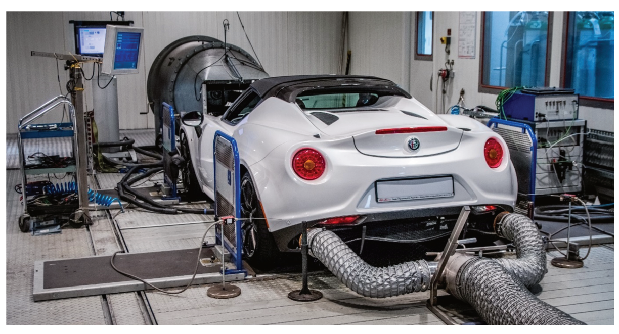
Fig. 13. BOSMAL's climate-controlled 4WD chassis dynamometer for R&D and certification work on conventional, hybrid and fully electric powertrains

Compliance to the emission limits in the new WLTC cycles and measurements in real RDE traffic, as well as the introduction of new research methods for the study of hybrid and electric powertrains is a very complicated and expensive process for vehicle manufacturers, requiring increased investment in research and development and even entire new research laboratories, which is what BOSMAL has been doing for years, making it currently the largest research and development facility of its type in Central and Eastern Europe (Fig. 13).