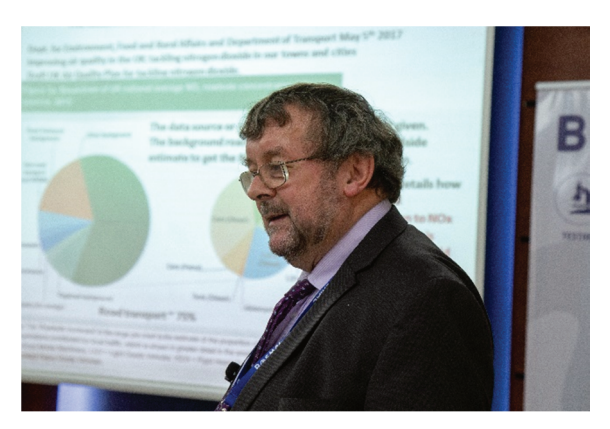
Fig. 12. Prof. Gordon Andrews ( University of Leeds, UK) delivering his presentation

tion levels are caused by traffic jams and sub-optimal or inadequate road layout, which is related to the low mean driving speed, the high frequency of stop events and the frequency and intensity of acceleration events, which often occur from idling. This is the main cause of high levels of air pollution in urban areas. Traffic conditions with very high emissions intensity and very low mean speed (below 15 km/h) are not included in the new WLTP and RDE tests. RDE tests of cars and heavy goods vehicles with an SCR catalytic system on congested roads in Leeds, UK as well as in China have shown that the highest emissions occurred when pulling away from a standstill and that the final emissions are correlated with the mean driving speed, a revelation which should be taken into account in further modifications to RDE regulations.