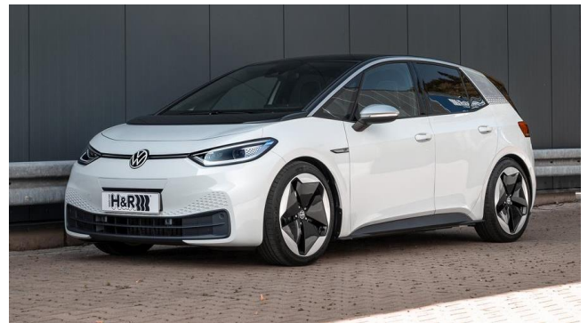
Fig. 2. Compared EV vehicle – Volkswagen ID 3 PRO S [16]

The representative of EV vehicles is the 2022 Volkswagen ID 3 PRO S (Fig. 2). In 2017, the Volkswagen brand announced plans to focus on electric vehicles. The strategy of the company includes introducing at least 30 EV models to the market by 2025 and achieving 20–25% of total annual sales (2–3 million) from electric vehicles. The ID model is the first series of electric cars by the VW group, designed from scratch as electric vehicles. According to Volkswagen, ID stands for "Intelligent Design, Identity, and Visionary Technologies". The market value of the model is 187,990 PLN (Q2 2022). The Volkswagen ID 3 PRO S vehicle is equipped with an electric motor, with a maximum torque of 310 Nm (Table 1).