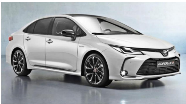
Fig. 1. Compared ICE vehicle – Toyota Corolla XII [15]

The representative of internal combustion engines was the Toyota Corolla XII in the sedan version (Fig. 1). The market value of the model in the comfort version is 124,999 PLN (Q2 2022). The Toyota Corolla vehicle has a displacement of 1.490 cm 3 . It is equipped with a gasoline engine, which has a maximum torque of 153 Nm at 4800 rpm (Table 1).