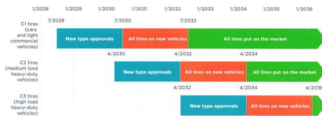
Fig. 3. Dates of introducing tire wear limits through the Euro 7 standard [27]

The Euro 7 standard will also introduce limits on PM emissions from tire abrasion. As a consequence, only tires with abrasion rates below the Euro 7 limits will receive type approval. The required testing procedure and emission limits are currently being developed by the United Nations Economic Commission for Europe (UNECE) and will be introduced as an amendment to the Euro 7 regulations. If the UNECE regulation is not adopted in time, the Commission will be given the authority to develop a procedure for assessing PM emissions from tires and setting limits on this emission. As shown in Fig. 3, the Euro 7 requirements will cover different tire classes at different times – first, C1 tires from July 2028, then C2 tires from April 2030, and finally, C3 tires from April 2032. The order of introduction will be same for all categories. In the first stage, the Euro 7 standard will apply to new tire models that receive type approval for the first time. A year later, new vehicles placed on the market will have to be equipped with Euro 7 approved tires, and a year later all tires placed on the market must meet Euro 7 requirements.