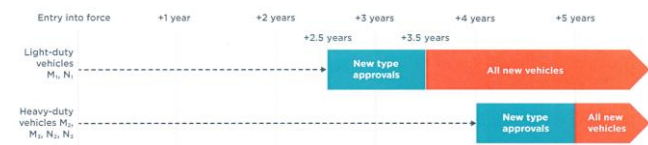
Fig. 2 Schedule for the rollout of the Euro 7 standard for vehicles of various categories [27]

The scope of the proposed Euro 7 standard goes beyond the current vehicle type approval requirements contained in Euro 6 [45, 74, 129]. The Euro 7 standard extends regulatory requirements to the type approval of braking systems and tires, in particular with regard to particulate emissions and the occurring abrasion process. The regulation applies to tires of classes C1 (passenger cars and commercial vehicles), C2 (light commercial vehicles) and C3 (heavy commercial vehicles), in accordance with UN Regulation 117. As a result, the Euro 7 standard will include a requirement to limit the maximum emissions of PM 10 particulate matter from brake pads and tires. Generally speaking, for electric cars it will be 3 mg/km, for combustion passenger cars, hybrids and hydrogen cars 7 mg/km, and for large vans and delivery vehicles 11 mg/km [7, 27]. The Euro 7 emission standard will apply for the first time to the type approval of new models of light vehicles and their braking systems 2.5 years after the regulation enters into force – Fig. 2. A year later, all newly registered vehicles will have to meet the new Euro 7 requirements. Euro 7 heavy goods vehicles will apply to new vehicle models 4 years after entry into force, and after 5 years to all new vehicles.