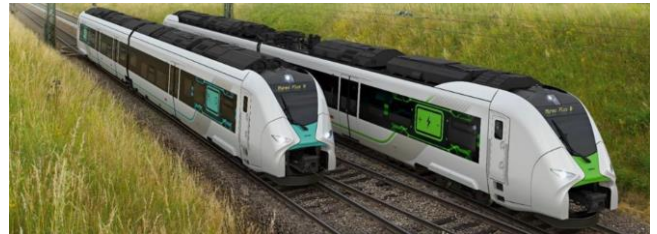
Fig. 2. Mireo Plus H by Siemens in two drive versions [29]

Siemens Mobility is also one of the manufacturers that has placed its hydrogen vehicles on the global market. Its Mireo Plus H has undergone tests, among others, on German rail routes in regional traffic. Siemens recently won a contract to supply its solutions. By the end of 2026, three Siemens Mireo Plus H (Fig. 2) trainsets will start operating on the Südostbayernbahn network in Bavaria [28, 29].