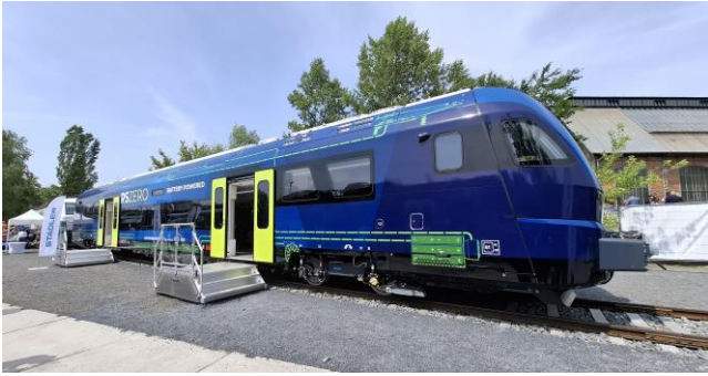
Fig. 3. RS ZERO vehicle produced by Stadler